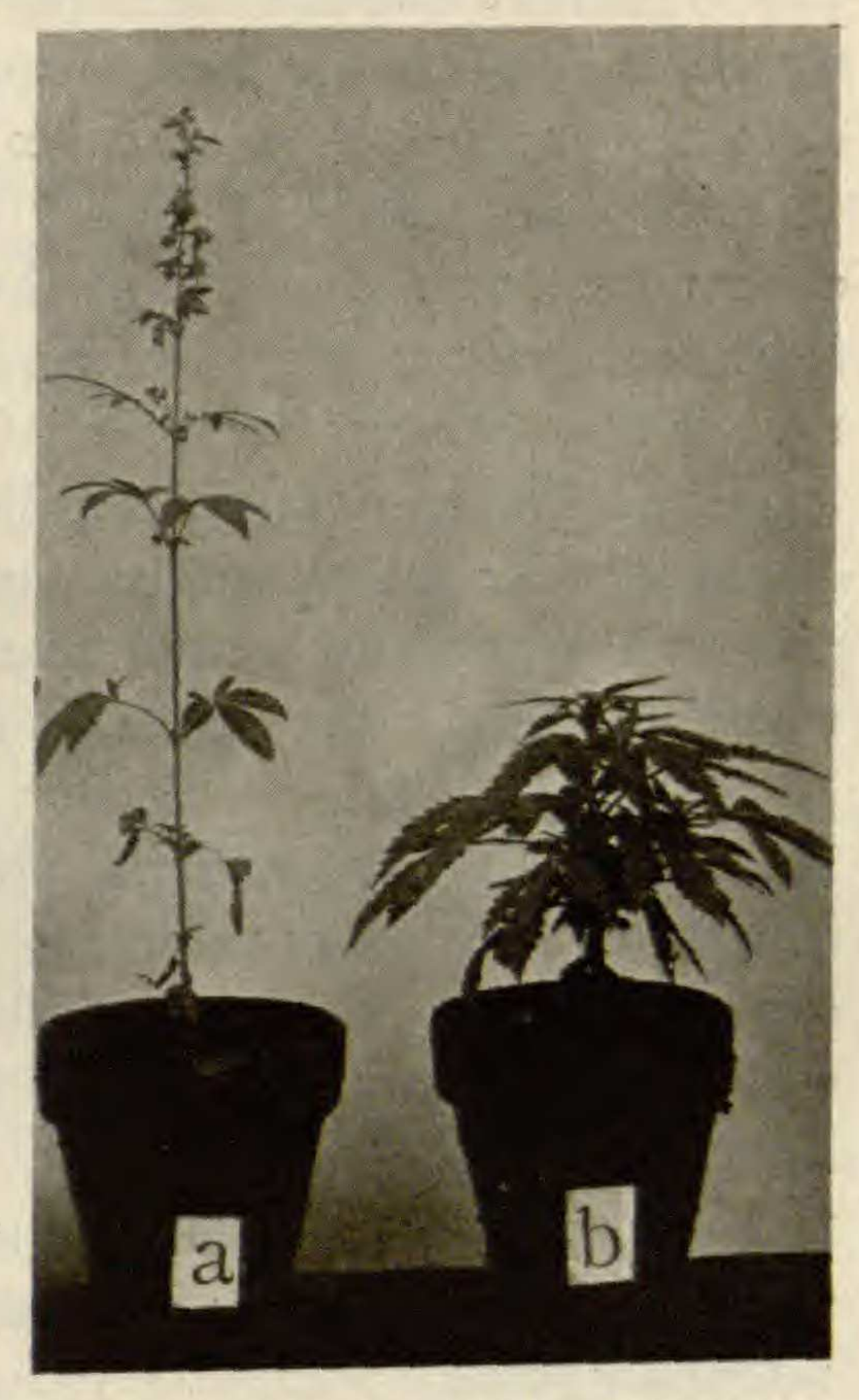
Fig. 1.—Cannabis sativa: staminate (a) and carpellate plant (b) of same age, grown in greenhouse in winter, showing decided sexual dimorphism; each plant showed reversal of sex and produced sporophylls of opposite nature; plants transferred from plot in greenhouse to pots just before being photographed.

Hemp as grown under normal conditions is distinctly dimorphic, both as to flowers and vegetative characters. The vegetative dimorphism, however, is much greater in plants grown under the abnormal greenhouse environment (text fig. 1, a and b). The plants experimented with, of course, had their sexual state already established in the embryo of the seed, and whatever changes were induced had their origin during the vegetative growth, between the period of sprouting and the origin of the